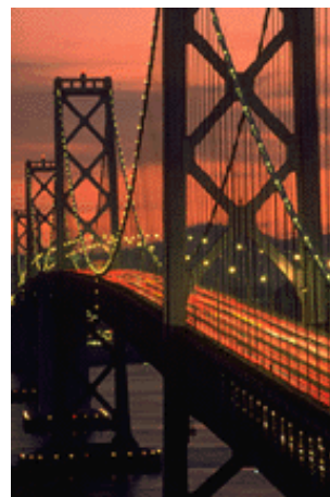
Support—Single support center for all services at every office location

With the new system in place, Duane was able to leverage vCom's expertise in providing on-going support of Telecommunication Services.